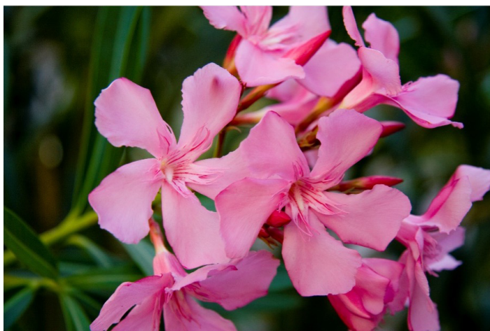
Figure 3. Oleander is a salt-tolerant landscape plant that can be grown in most areas of Florida.

(2) Use the Florida-Friendly Landscaping™ principle of “right plant, right place.” Reclaimed water can contain higher levels of salts compared to drinking water. Some landscape plants have a sensitivity to too much salt in irrigation water and soil. Therefore, if you irrigate with RW, watch your landscape for signs of salt damage. Signs of salt damage include plants that wilt even when water is plentiful, stunted growth, browning or yellowing of leaf edges, and foliar damage. If necessary, plant only salt-tolerant species. (See publication #ENH26 for a list of salt-tolerant landscape plants for Florida.) If you suspect salt injury may be a factor, you can also have your soil and irrigation water tested for salt levels by the UF/IFAS Extension Laboratory. Information on how to test your soil and water can be found at publication #SL262 .