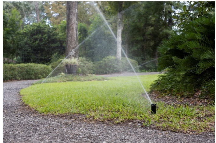
Figure 1. In Florida, more than half of reclaimed water used is for urban irrigation.

Reclaimed water is former domestic wastewater that has been treated at a wastewater treatment plant and that is then sent back to a community for various reuse applications. Reusing the water can be thought of as a way of recycling the former wastewater by putting it to a new use after it has been cleaned. In Florida, most RW is used to irrigate lawns, urban green spaces, and golf courses. By Florida law this water must have received at least secondary treatment and disinfection before it can be reused. These treatment processes remove many harmful pollutants in the water, such as pathogens that cause diseases and numerous chemicals found in wastewater. You can learn more about how RW is produced, transmitted, and used in Florida by visiting publication #SL339 .