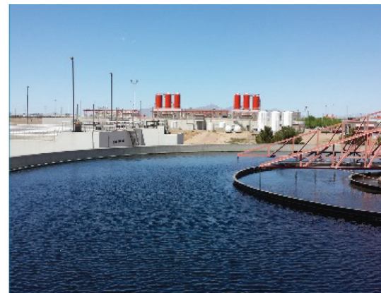
Bustamante WWTP Secondary Effluent (10 mgd)