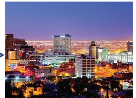
To Distribution System