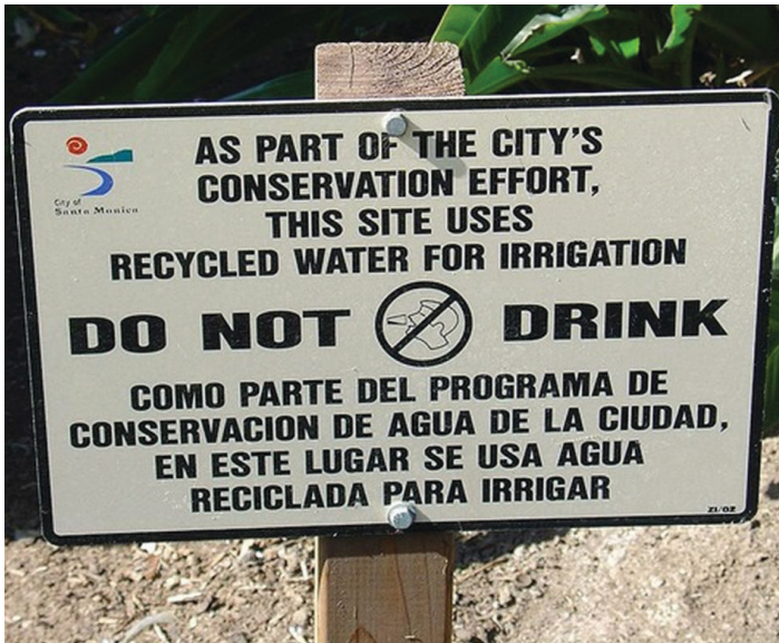
Figure 3. Advisory sign alerting the public to avoid drinking reclaimed water.

Throughout Florida (and the rest of the United States), reclaimed water is transmitted in purple pipes that are kept separate from the pipes that transmit drinking-quality water. Areas that use reclaimed water must also post signs to alert the public of its use (Figure 3). For example, communities that use reclaimed water may post a sign at the neighborhood entrance, and golf courses may post signs at the first and tenth tees. Advisory signs must also include the warning in English and Spanish, "Do Not Drink" and "No Tomar," respectively. Additionally, if reclaimed water is used in a fountain or stored in a pond, it must include an advisory sign that says "Do Not Swim" or "No Nadar" in Spanish.