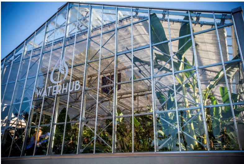
BILD is a collaborative global community of practice working to uncover opportunities, advance implementation, and spread transformative solutions related to decentralized water systems to support the efficient use and reuse of water.