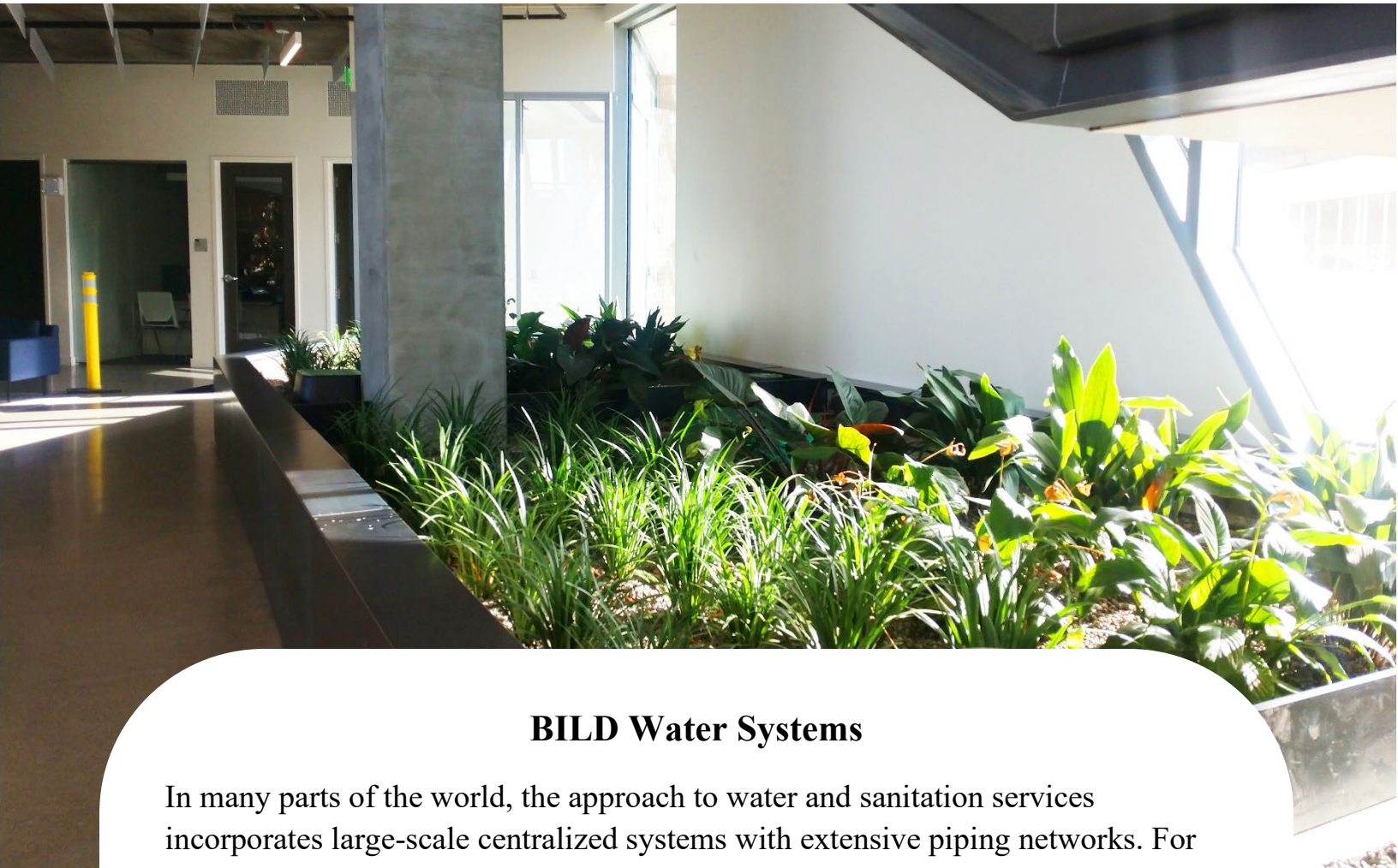
BILD Water Systems

In many parts of the world, the approach to water and sanitation services incorporates large-scale centralized systems with extensive piping networks. For some communities with centralized water and sanitation systems, they can pose economic, social, and environmental challenges to the communities they serve. Moreover, centralized water infrastructure may limit flexibility, adaptability, and overall resilience amidst emerging extreme events due to climate change.