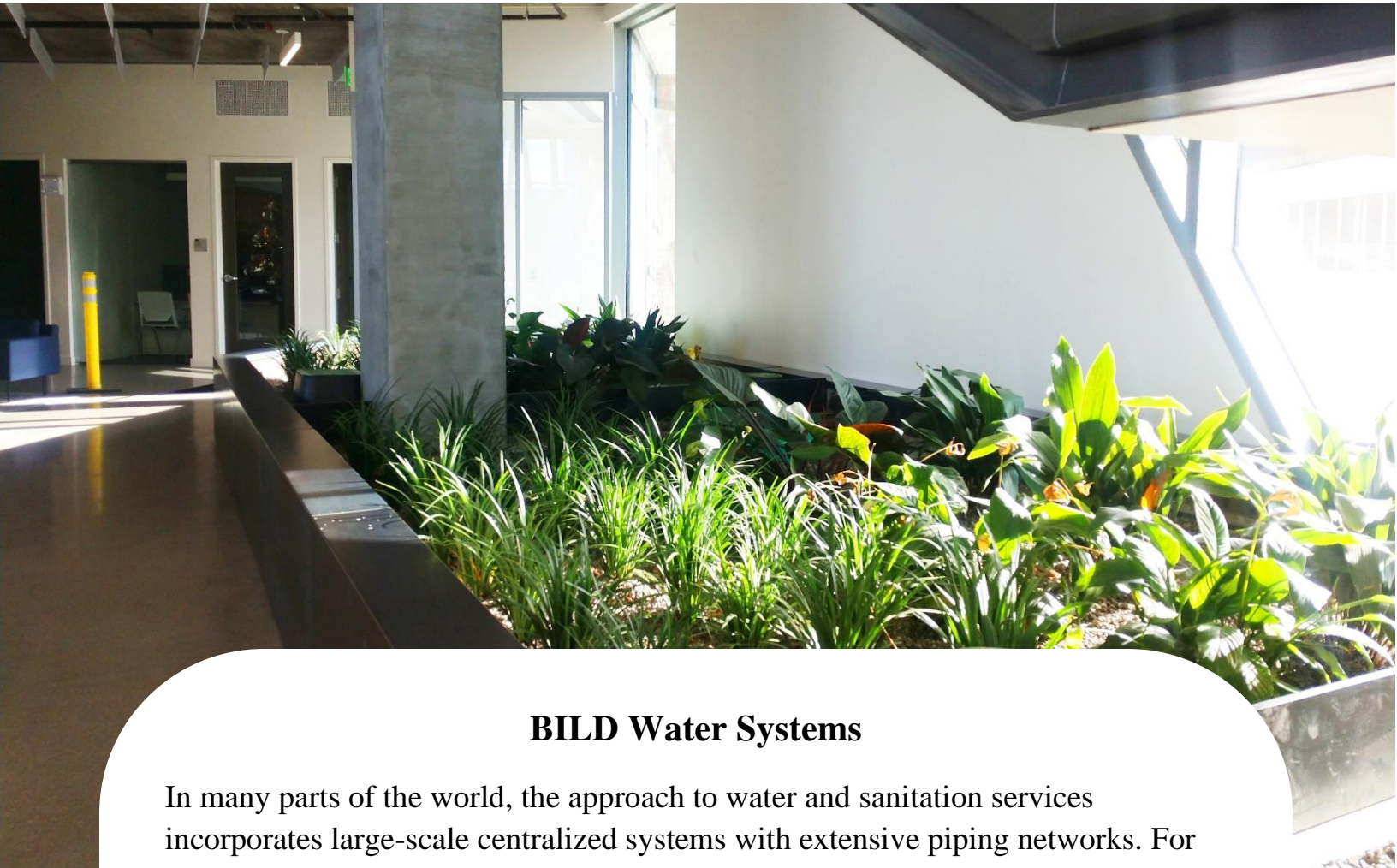
BILD Water Systems

In many parts of the world, the approach to water and sanitation services incorporates large-scale centralized systems with extensive piping networks. For some communities with centralized water and sanitation systems, they can pose economic, social, and environmental challenges to the communities they serve. Moreover, centralized water infrastructure may limit flexibility, adaptability, and overall resilience amidst emerging extreme events due to climate change.