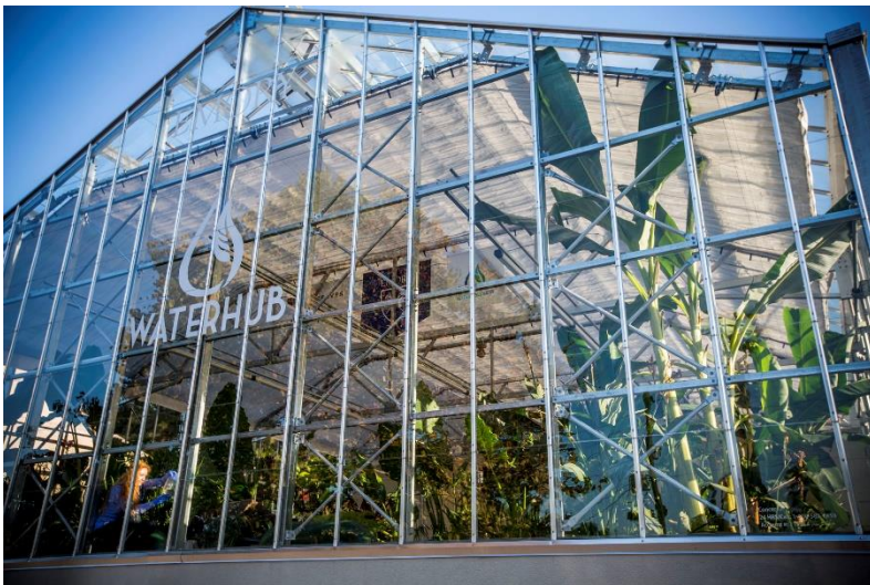
BILD is a collaborative global community of practice working to uncover opportunities, advance implementation, and spread transformative solutions related to decentralized water systems to support the efficient use and reuse of water.