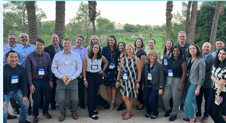
WRCA Statewide Chapter Leadership, November 2023