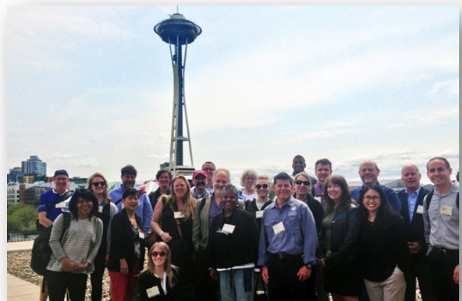
National Blue Ribbon Commission visits rainwater harvesting system on the Gates Foundation rooftop in Seattle, WA (2018).

The commission is comprised of representatives from municipalities, water utilities and public health agencies from 14 states, the District of Columbia, US EPA, and US Army Engineer Research and Development Center, the city of Vancouver, and the city of Toronto. See the full list of commissioners .