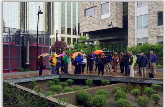
National Blue Ribbon Commission inspects the Hasslo & 8 th Ecodistrict's onsite water recycling in Portland, OR (2016).

Other research is also underway by the National Blue Ribbon Commission, including expanding the risk-based framework, researching pathogen crediting for natural treatment systems, aligning plumbing codes and standards with the risk-based approach, addressing how onsite water systems can play a role in equity and climate change issues, and conducting life cycle assessments evaluating the environmental and economic effects of community-scale onsite water reuse adoption.