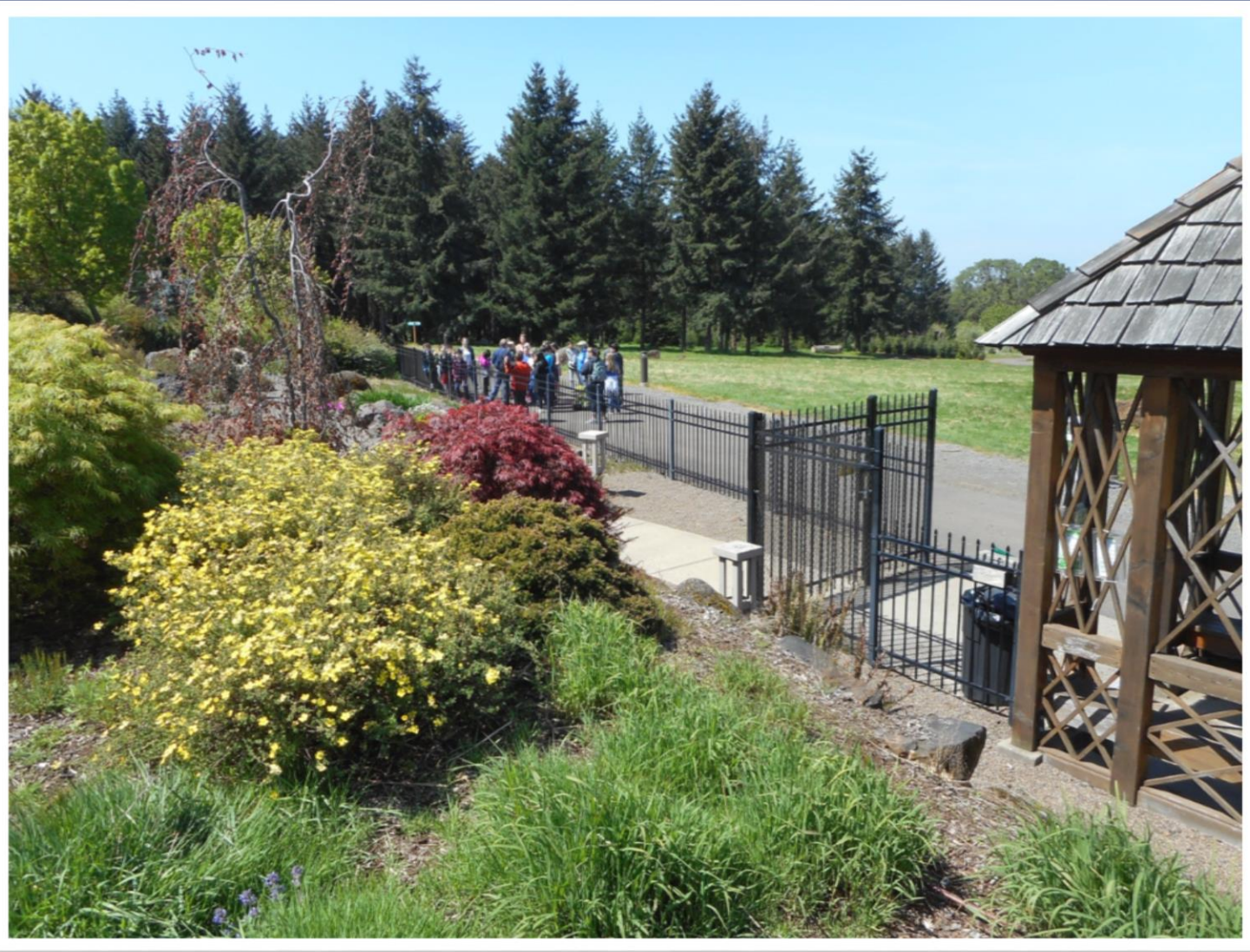
Resort to Garden Access Point