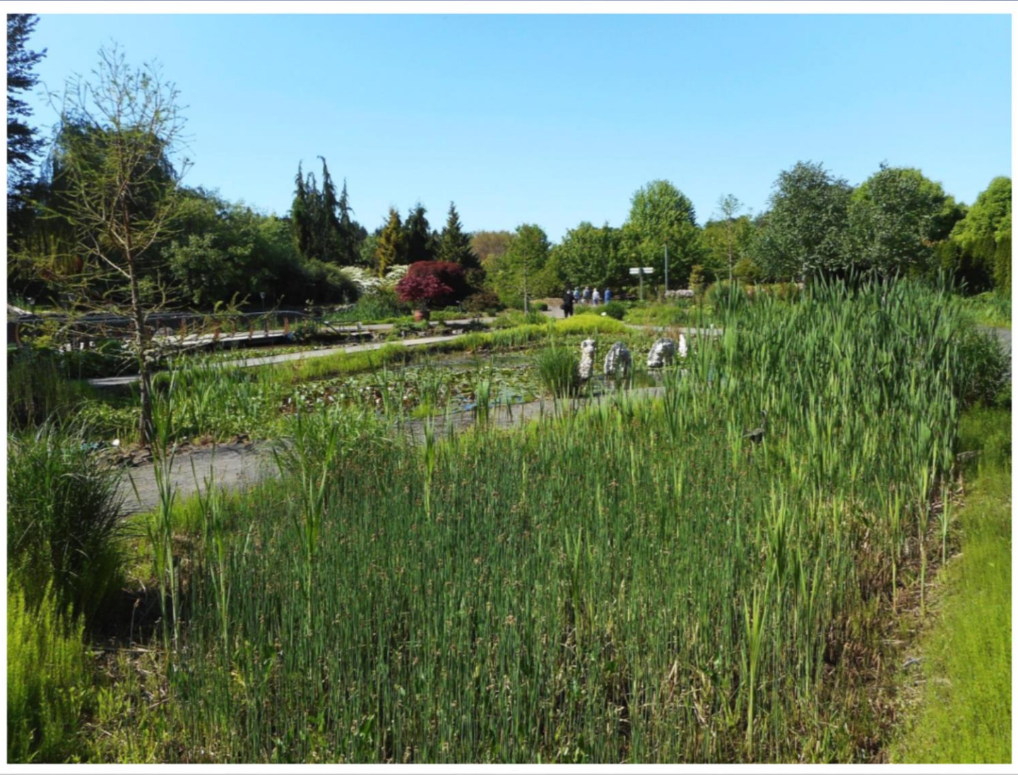
The Amazing Water Garden