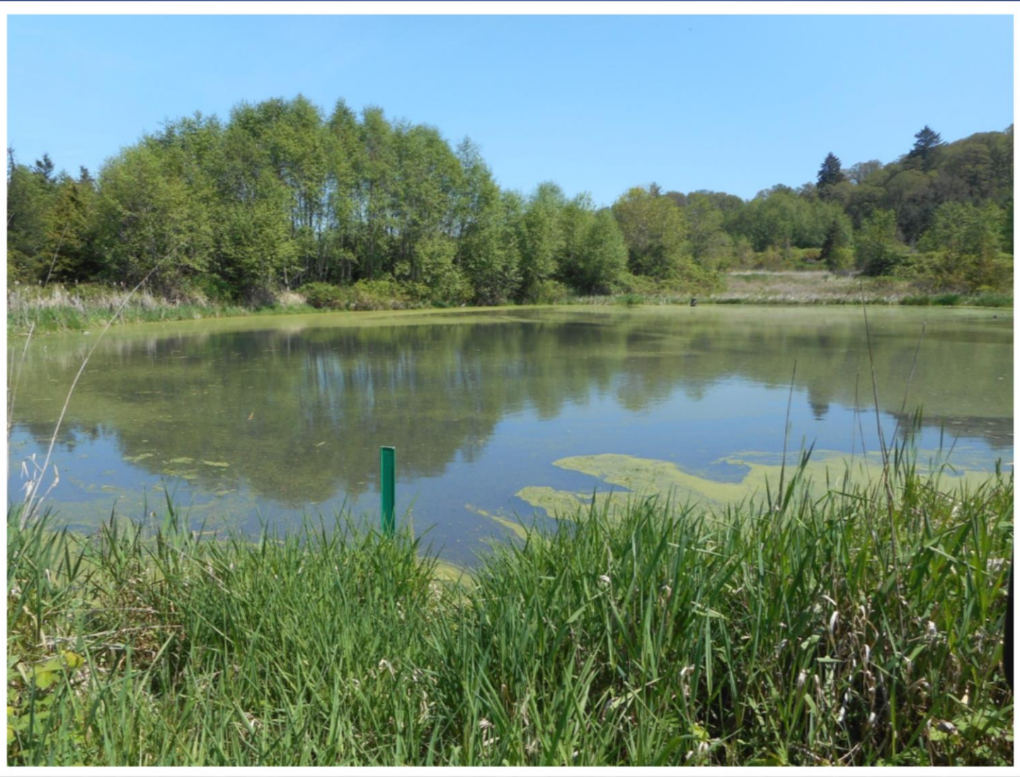
Wetlands Complex C