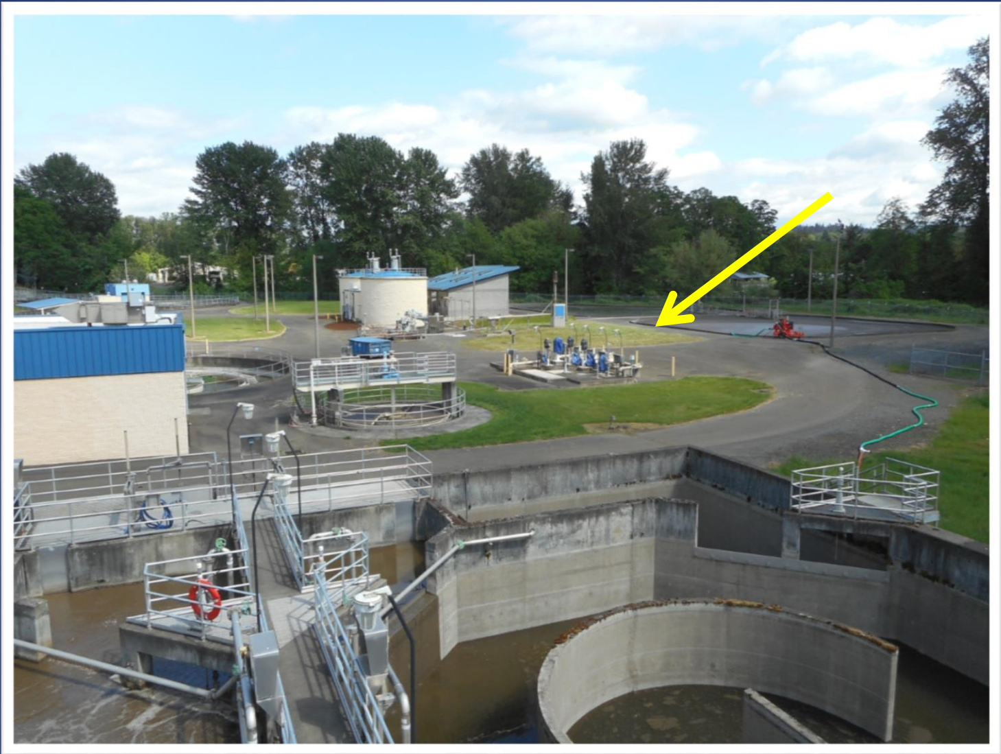
City of Silverton Effluent Pump Station