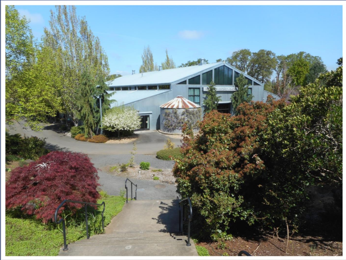
Oregon Garden Pavilion (Former Horse Arena and Stables)