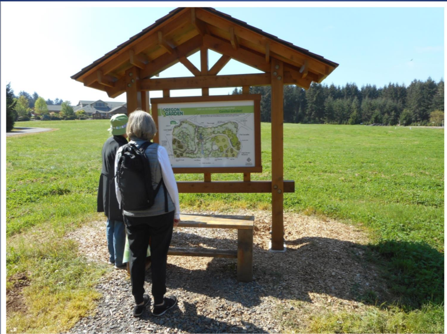
Visitors at an Informational Kiosk in Wetlands Area