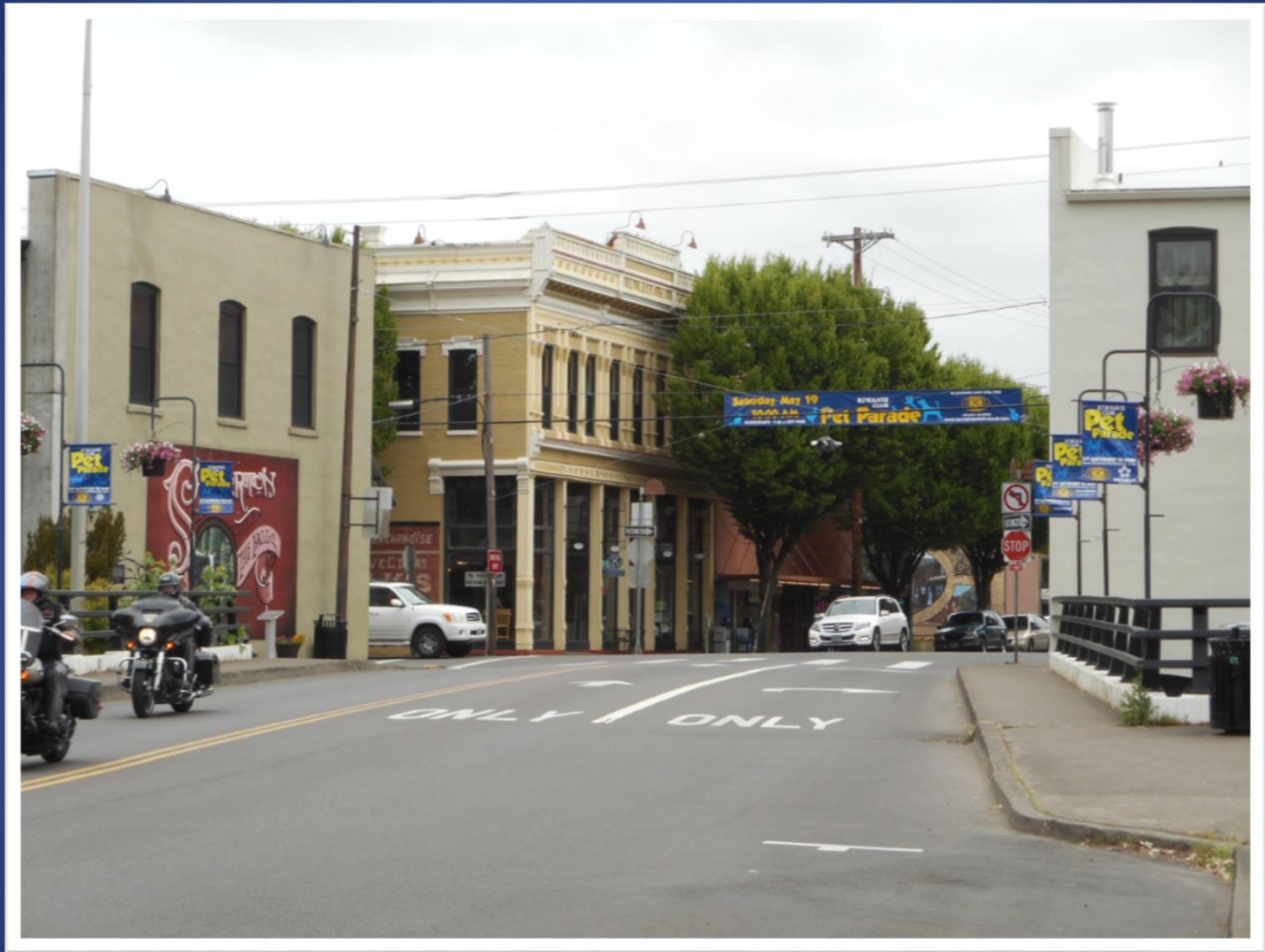
Historic Downtown Silverton