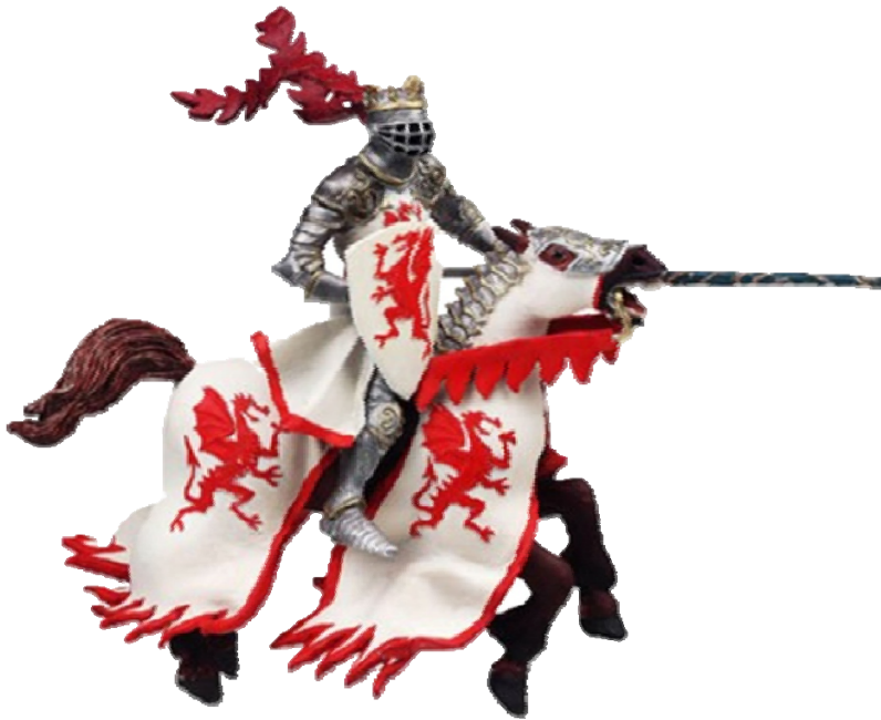
Sir Recycled Water