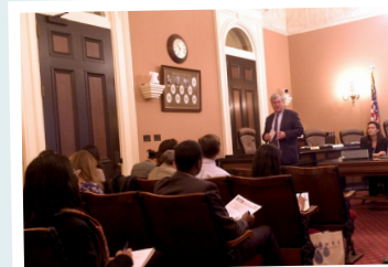
WRCA Legislative staff briefing in January.

In March 2014, the Board made $800 million in one percent loans available for water recycling projects from the Clean Water Act State Revolving Fund. This funding was made available for projects that can be completed within three years of the Governor's 2014 drought declaration. These low interest loans expire in December 2015. If you are interested in this program, applications must be submitted by Dec. 2, 2015 to the Board.