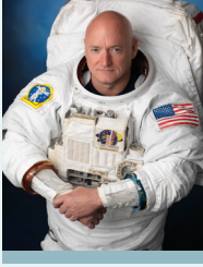
Keynote speaker Astronaut Captain Scott Kelly

More than 600 water professionals from 34 U.S. states, the District of Columbia, and nine countries participated—reflecting the largest attendance in nearly a decade. The Symposium featured over 100 technical sessions and a keynote address from Astronaut Captain Scott Kelly.