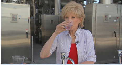
Lesley Stahl of 60 Minutes drinks purified water at the Orange County Water District.